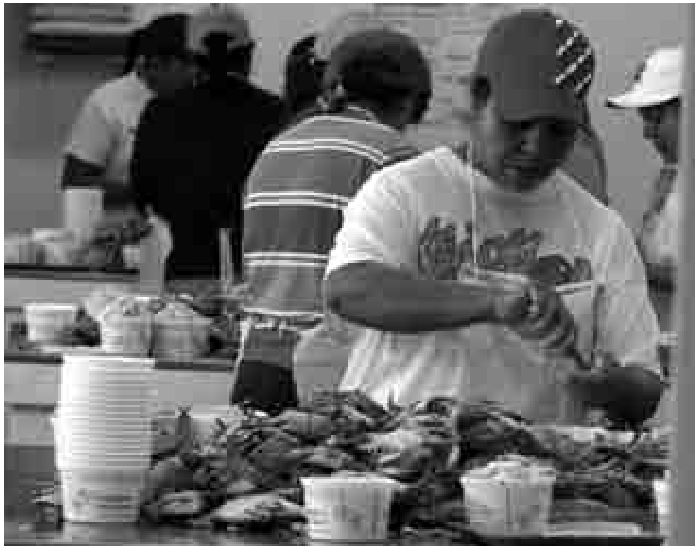
The Maryland crab industry is one of many industries that have come to rely upon H-2B workers.

Through conversations about their respective efforts, the Clinic and CDM conceived of a survey-based report that would provide data and analysis about the experiences of H-2B workers, to enrich legislative debates. The Clinic and CDM (hereinafter, “the authors”) focused specifically on H-2B workers from Mexico working in the Maryland crab industry on the Eastern Shore of Maryland.