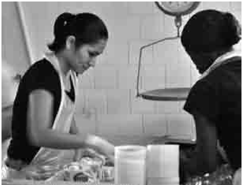
H-2B crab pickers are paid a piece rate, based on the pounds of crab meat picked each day. "Weighers" therefore play an important role in the crab house.

While concerning, most of these employer practices do not violate existing federal and state wage and