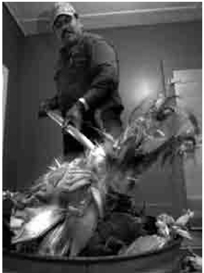
In Maryland crab houses, tasks are typically divided along gender lines. Male workers wash the crabs, and transport them to female workers, who pick the crab meat.

These fears demonstrate the inherent vulnerability of women working in the U.S. on H-2B visas. For Bauer, the “real issue is how vulnerable” the women working in H-2B reliant industries are because “given the legal structure, women are not going to assert their rights.” 236 Women might be verbally or emotionally abused, threatened with deportation if they do not provide