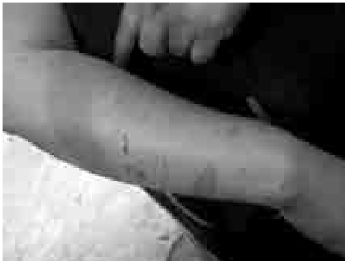
Due to their work with knives and the handling of the crabs, migrant worker women often experience cuts and bruises on their hands and arms. Some women also experience allergic reactions when exposed to crabs steamed in a chlorine wash.

to these claims, and even if they are aware, they lack the legal resources to pursue the claim, and fear retaliation by their employers.