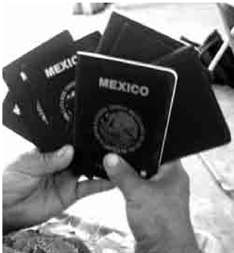
Maryland crab companies have increasingly come to rely on the labor of Mexican women recruited through the H-2B visa program.

One might also argue that the H-2B workers' reluctance to complain about wages and working conditions - which derives from their inherent vulnerability in the workplace - makes them more attractive to employers. H-2B workers are often unaware of the rights that they enjoy under U.S. employment and labor laws. Without knowledge of these protections, workers are fearful that workplace complaints will result in deportation. Recruitment agencies have often touted the "reliability" and "productivity" of H-2B guestworkers. 62 While these are certainly laudable attributes, such comments often mask the vast power differences that exist between employers and workers.