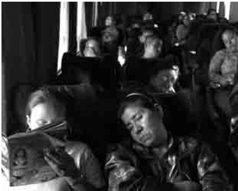
Migrant worker women in the Maryland crab industry must travel thousands of miles by bus, from rural Mexican communities to the Eastern Shore.