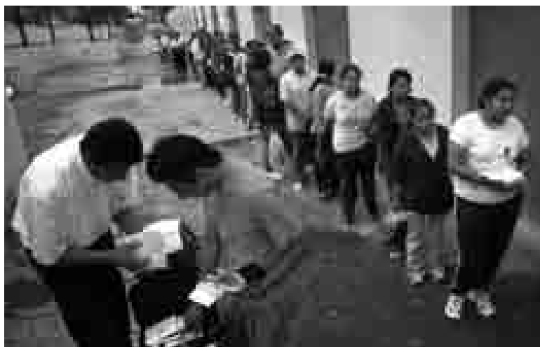
As part of the recruitment process, H-2B workers must appear for an interview at their nearest U.S. consulate. The consulates are often located a considerable distance from the workers' home communities. As depicted here, long queues at the consulate are the norm.

Not only do the local recruiters determine where workers are employed in the U.S., they also dictate the manner in which workers pay fees associated with H-2B recruitment. Despite the fact that charging H-2B