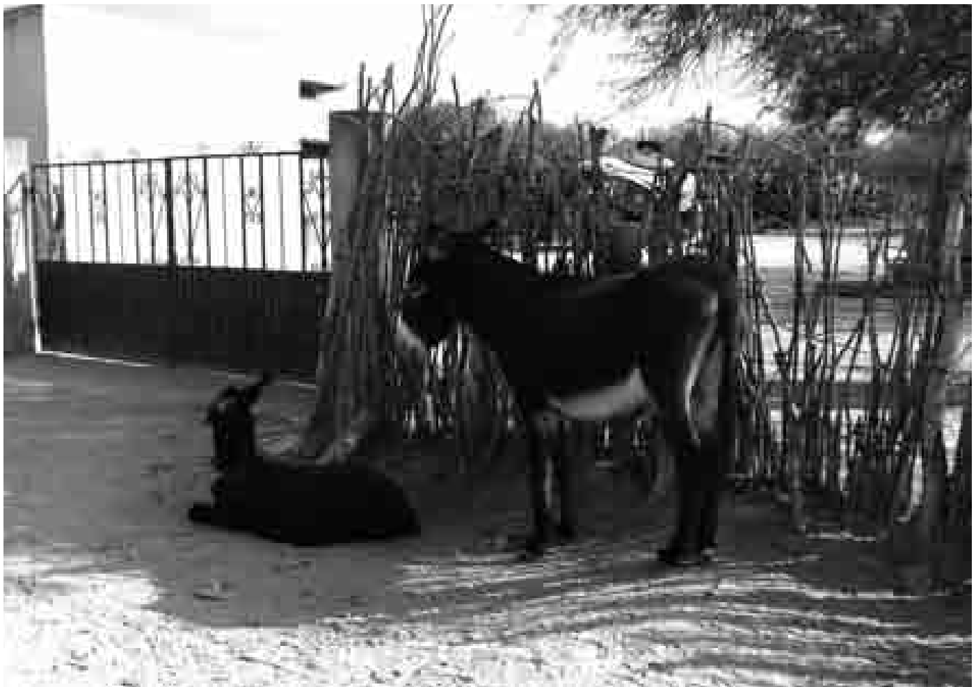
Communities that send migrants to work in the Maryland crab industry are often devoid of meaningful local economic opportunities.

with a single local contractor who relies on favoritism and personal connections when offering the limited number of visas to residents.