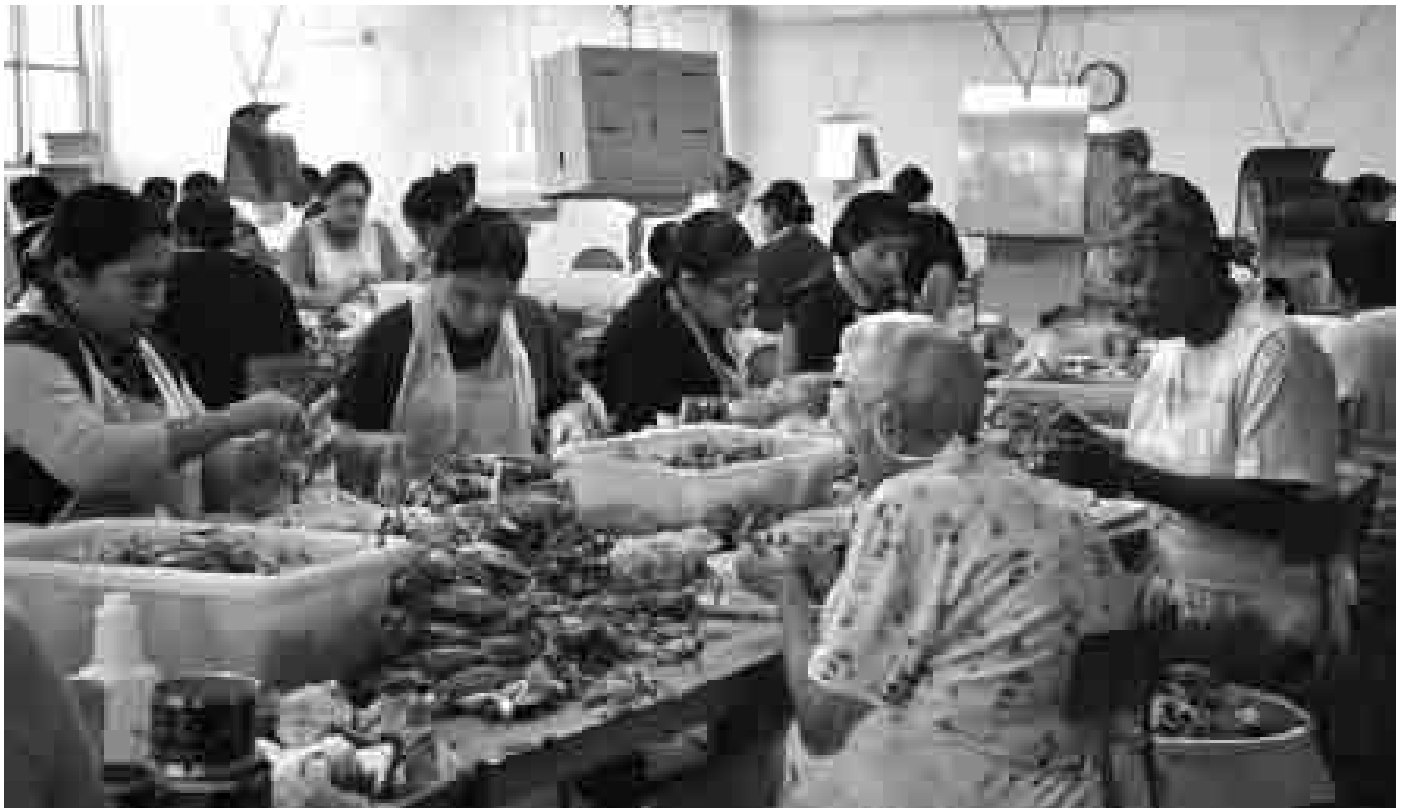
Crab pickers work at long tables, extracting the valuable crab meat as quickly as possible. Although the Maryland crab industry now relies heavily upon H-2B migrant worker women from Mexico, some crab houses still employ African-American and white women workers.

Picking crabmeat is a tedious and labor-intensive job. The women work silently and intensely, using a sharp knife to separate the valuable jumbo lump from the backfin, taking care not to include any shell parts with the meat.