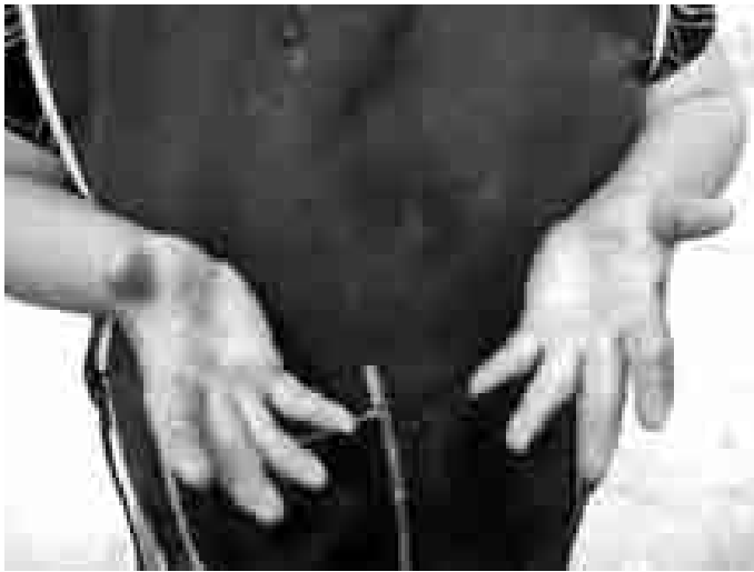
Experienced crab-pickers, employed in the industry for many years, often develop swollen, arthritic hands due to the repetitive nature of crab-picking work.