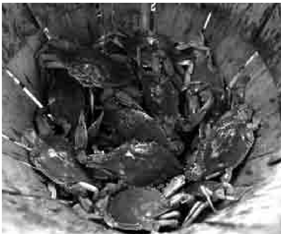
The blue crab is closely identified with the State of Maryland. Each year, the crab industry contributes millions of dollars to the state economy.

Indeed, the industry has come to heavily rely on H-2B guestworkers. One study found that the loss of H-2B workers would result in a $9.5 million loss in direct revenue for the crab industry, which is nearly half of the industry’s average revenues from 2003-2007. 54 Because of this dependence, Maryland has been at the forefront in fighting for an increase in the number of H-2B visas issued, arguing that its seafood industry will collapse without access