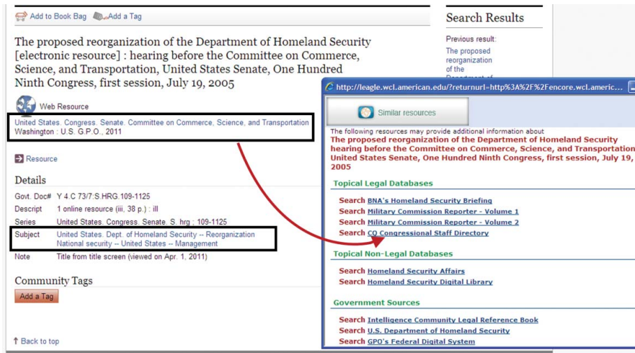
FIGURE 2 The Pathfinder Pro software triggers a listing of the “CQ Congressional Staff Directory” database (follow curved arrow) because of this database’s semantic connection to the value in the author field. Links to the “national security” databases appear on the Pathfinder Pro panel because of their relevancy to the subjects in the record (color figure available online).

appearance of resources in these categories based on their relevancy to the data in the bibliographical record.