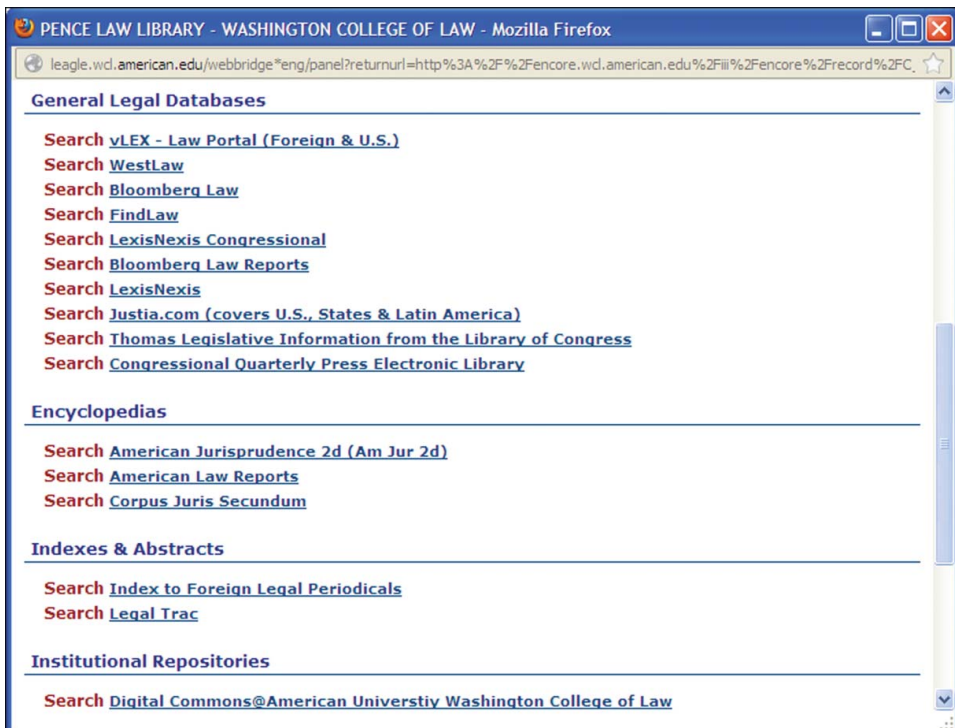
FIGURE 7 “Constant” categories provide immediate links to the general legal resources (color figure available online).