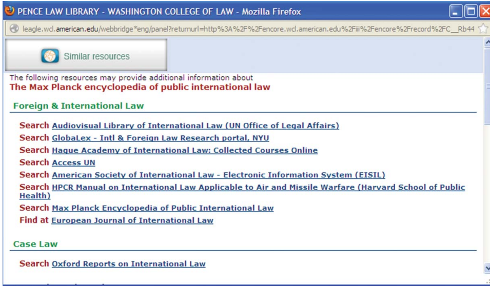
FIGURE 6 List of resources evoked by the subject “international law” (color figure available online).