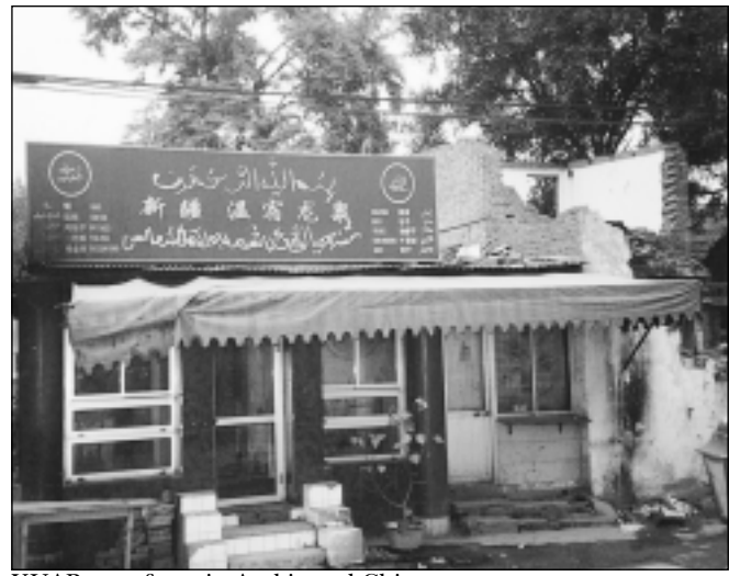
XUAR storefront in Arabic and Chinese.

According to a 1999 Amnesty International Report on human rights violations in the XUAR, even if prisoners receive a trial, the process is a mere formality because political authorities typically