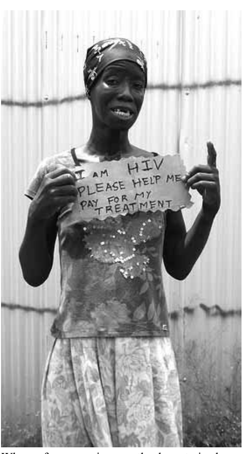
When refugees are incorrectly characterized as illegal immigrants by xenophobic healthcare professionals, they are prohibited from receiving free ARV treatment and thus required to pay substantial fees for medical assistance.

It is important to distinguish that the poor education of medical professionals regarding the rights of refugees is distinct from xenophobia. Such misinformation is a result of many factors, including a lack of resources, failure of healthcare administrators to inform medical workers regarding refugee rights to ARV treatment, and the government's failure to enforce the laws. As a result, many refugees succumb to treatment interruption<sup>43</sup> out of fear of intimidation or rejection. Jonathan Whittall, program director for Médécins Sans Frontiéres (MSF) asserted that "often . . . MSF personnel will have to accompany refugees to clinics to ensure they are given medical attention."