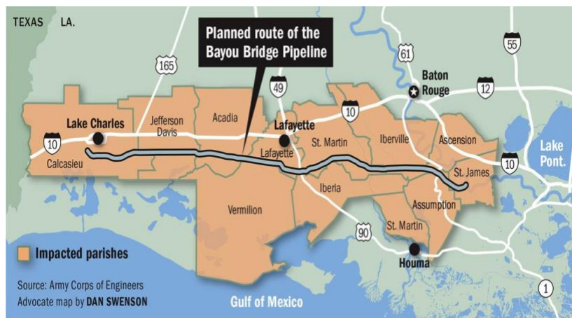
Map of Bayou Bridge Pipeline, Dan Swenson, The Advocate 185

The Bayou Bridge Pipeline actually connects with the Dakota Access Pipeline in a somewhat roundabout way, linking thousands of miles across the nation at the southern border of Colorado. 183 The pipeline is, according to the American Civil Liberties Union (hereafter “ACLU”), 162.5 miles long, “from Lake Charles to St. James, through 700 bodies of water, including the Atchafalaya Basin and Bayou LaFourche, the source of drinking water for the United Houma Nation and other surrounding communities.” 184