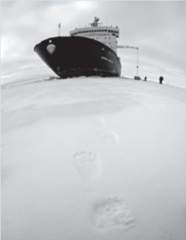
Polar bear tracks found near the Kapitan Dranitsyn.

States has been actively pushing the international community to consider the Canadian Arctic waters an ‘international strait,’ permitting international commerce to pass through the Canadian waters freely under international law, while Canada argues that the environmental protection of the Arctic is better in their hands. 13 International law defines an international strait with geographical and functional qualifications. The geographical standard is not so much in dispute as the functional qualification, which would require international travel between the Canadian straits. 14 However, Canada does not currently have the resources to patrol the waters adequately to deter international usage. 15 Therefore, Canada may lose sovereignty over the waters as usage increases with the melting ice and there are insufficient enforceable international standards to protect the Arctic waters.