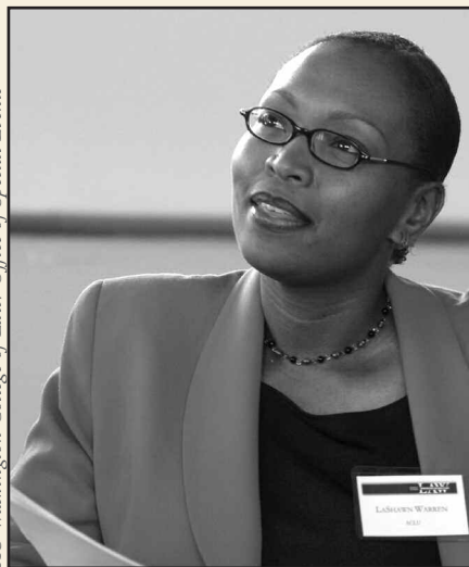
AU Washington College of Law/ Office of Special Events